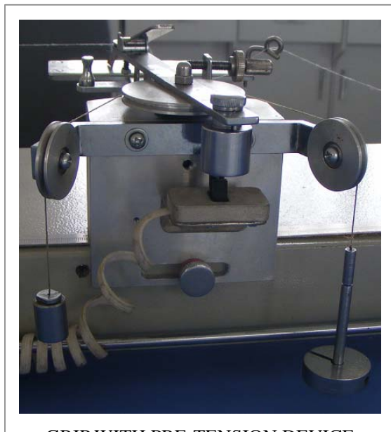
GRIP WITH PRE-TENSION DEVICE